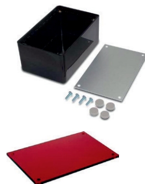
Red Acrylic Lid